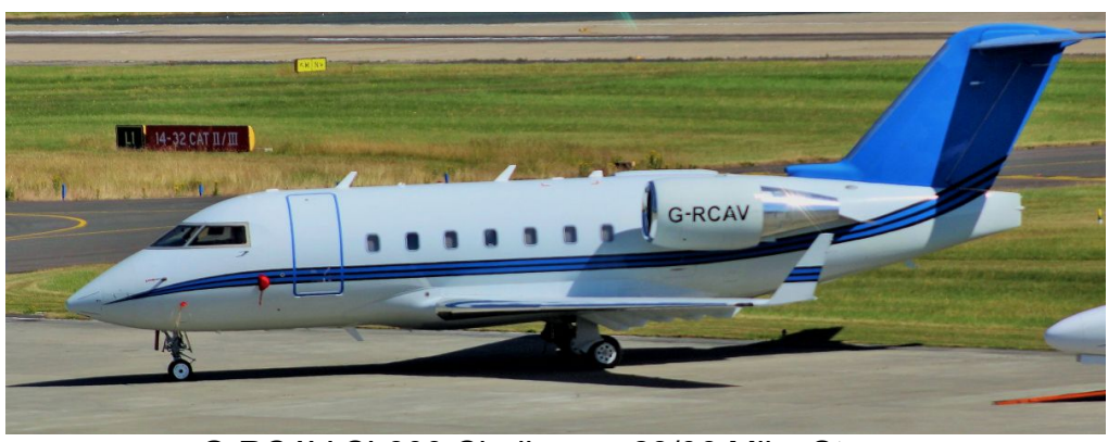
G-RCAV CL600 Challenger 28/06 Mike Storey