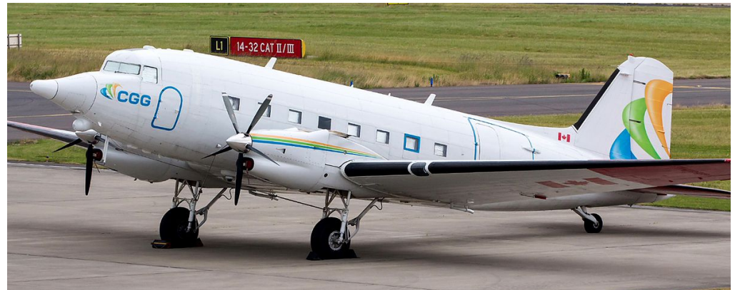
C-CGSU DC3C Basler BT67 18/06

Phenom 300 CS-PHF dep 10:01 to Le Bourget as NJE477F, Challenger 350 9H-VCM dep 10:32 to Munich as vistajet457, Cessna 421C Golden Eagle G-ISAR arr 11:19 fr Southampton dep 13;44 to Nottingham, Cessna 182 Skylane G-CWTT arr fr Teesside 13:38 dep 14:47 to EMA, Diamond DA42 G-FFMV dep 14:46 to Bournemouth. Beech Kingair E90 G-ORTH dep 15:33 to Teesside.