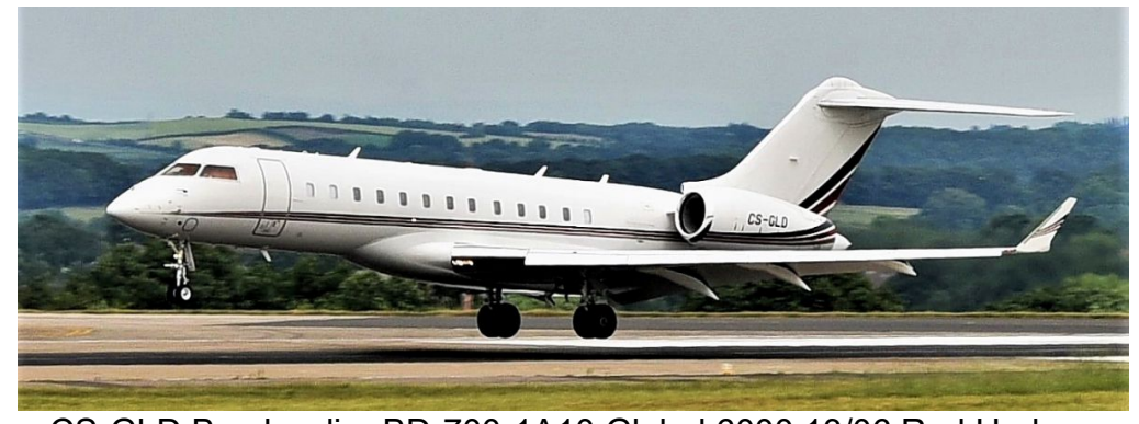
CS-GLD Bombardier BD-700-1A10 Global 6000 13/06 Rod Hudson