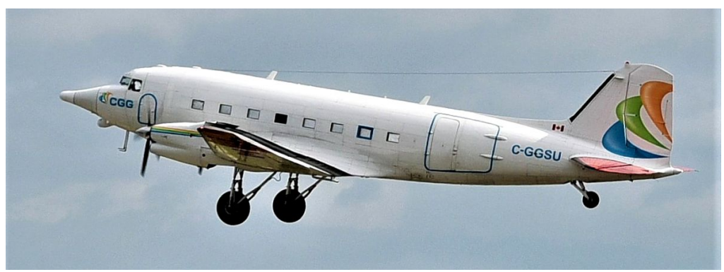
C-CGSU DC3C Basler BT67 18/06 Rod Hudson