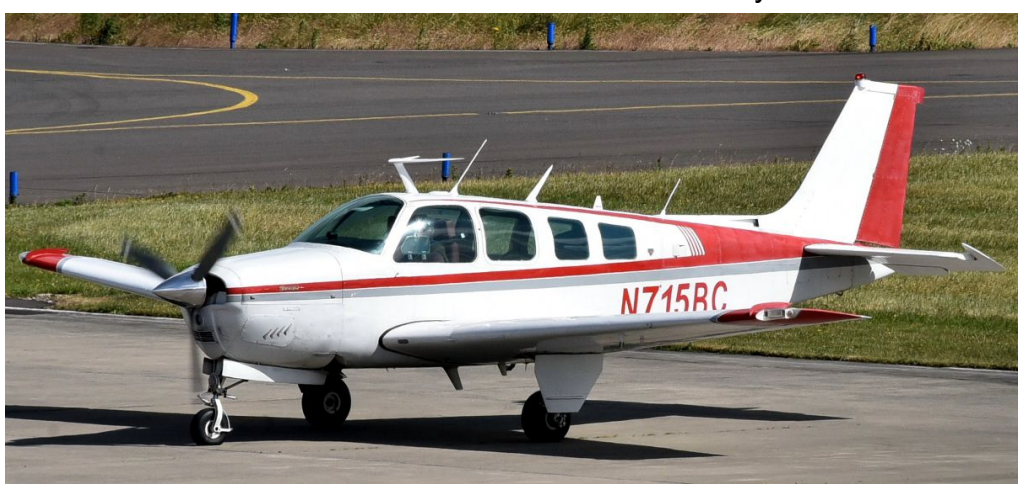
N715BC Beechcraft A36 Bonanza 18/06 Rod Hudson