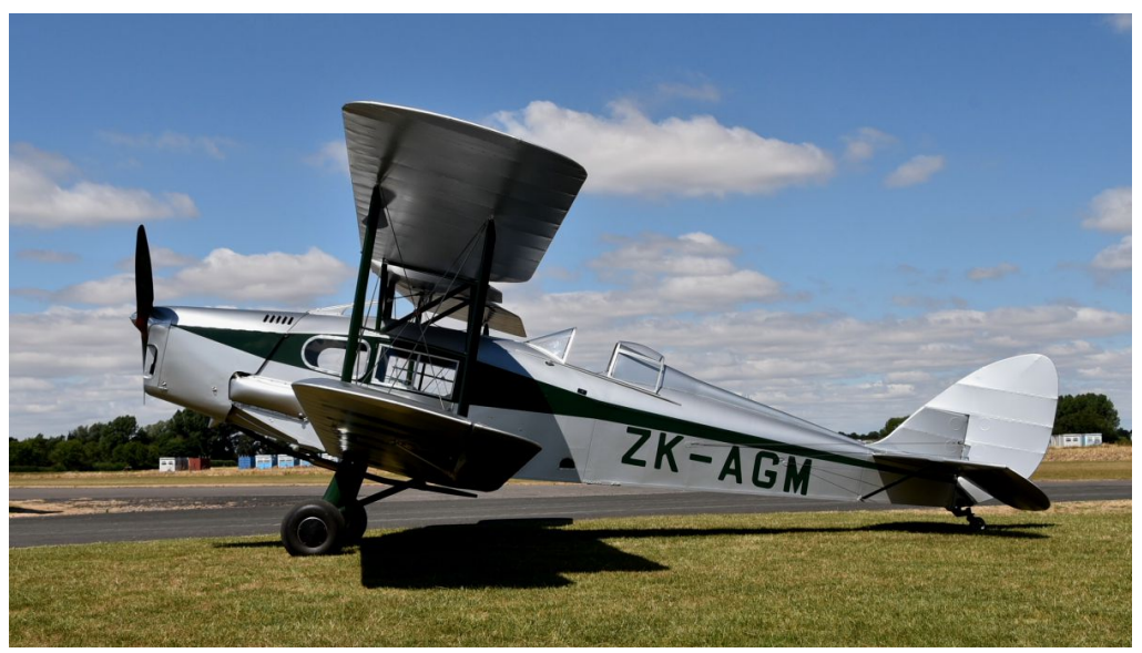
ZK-AGM DH83 Fox Moth Rod Hudson