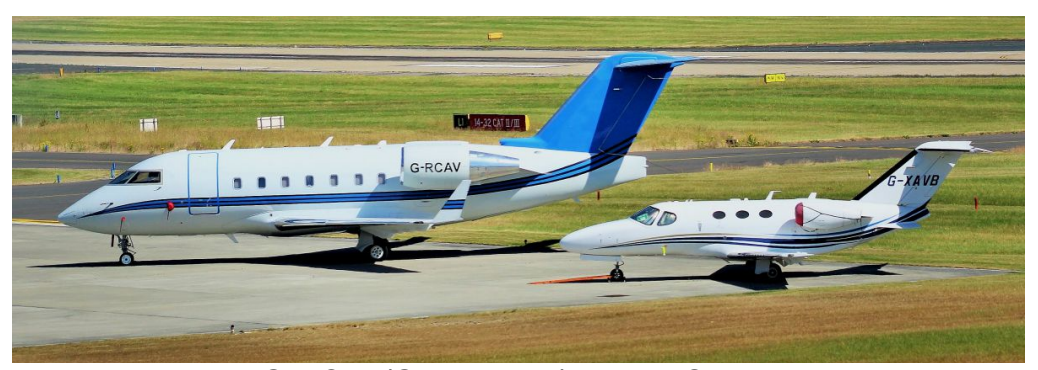
G-RCAV/G-XAVB 28/06 Mike Storey

Cessna 680 Sovereign CS-LTA dep 07:51 to Kerry as NJE852U ret at 21:22 as NJE872K n/s, Cessna 550 Bravo G-JBLZ dep 07:54 to Le Bourget, Beech 200 Kingair HB-GLB dep 08:50 ret at 13:54 & dep again 15:14 ret again at 16:57 n/s. Cessna 525 M2 F-HBTV arr 16:02 fr Zurich dep 16:46 to Le Bourget.