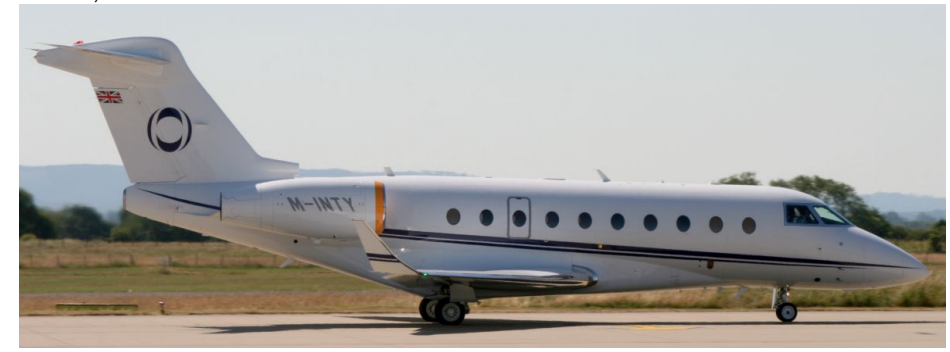
M-INTY Gulfstream G280 29/06

29/06 M-INTY Gulfstream G280 arrived 27/06 t Geneva Hampshire Aviation, N425DK Cessna 425 Conquest I f/t Fairoaks, G-BSYV Cessna 150M f/t Sandtoft E-Plane Ltd (P28A G-BCGI was tech, C150 G-BSYV brought parts in), G-JMCL Boeing 737-322F f/t