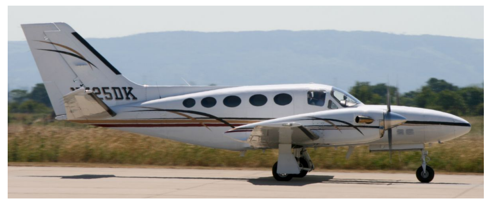
N425DK Cessna 425 Conquest I 29/06

30/06 N759AU Cessna 182 Skylane ?/? o/s, G-AYAW Piper PA-28 Cherokee E f/t Private site North East Flyers Group, D-CAMB Learjet 31A f Alicante t Hahn Jetcall, N755JG Socata TBM 900 n/s t Bournemouth Hallin Aviation Inc