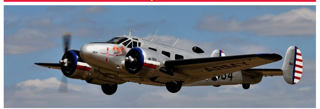
1164 (G-BKBL) Beech D185 Rod Hudson