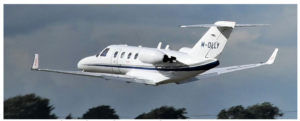
M-OLLY C.525 CitationJet CJ1 20/06

200 Kingair G-KVIP arr 14:38 fr Guernsey dep 18:02 to Exeter, Beechjet 400 OK-RAH arr 17:55 fr Malpensa dep 18:39 to Prague, Falcon 2000 CS-DFK arr 19:16 fr Farnborough as NJE546L dep 19:58 to Le Bourget as NJE216R,