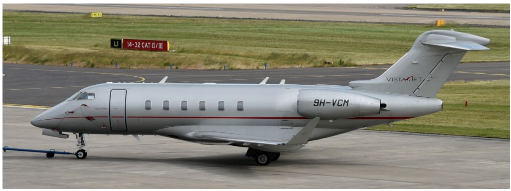
0H-VCM Bombardier BD-100-1A10 Challenger 350 18/06 Rod Hudson

Beech Kingair E90 G-ORTH arr 08:41 fr Newcastle until 19th, Learjet 31 G-CGGG dep 09:05 to Malaga, Cessna 182 G-XLTG arr 09:31 fr Sherburn dep 10:18 to Halfpenny Green ret at 15:35 and dep 16;07 to Sherburn, Piper PA-46 Malibu N264DB arr 12:41 fr Bournemouth dep 13:42 to Sandtoft, Learjet 60 D-CFAF arr 13:12 fr Sofia dep 14:32 to Neurenburg, Basler BT-67 <u>Turbo DC-3 C-GGSU (c/n 13439) of CGG Aviation</u> arr 13:21 fr Bari (Ita) n/s, Cessna 525 CJ1 D-IJLJ dep 14:12 to Farnborough, Challenger 350 9H-VCM arr 18:52 fr Girona as vistajet457 until 19th, Beechjet 400 SP-ATT arr 21:36 fr Luton n/s.