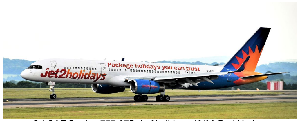
G-LSAE Boeing 757-27B Jet2holidays 13/06 Rod Hudson

G-POWS 8/6 (037E) positioned in from Birmingham, 9/6 235/236/489/490 then positioned back to Stansted(038E).