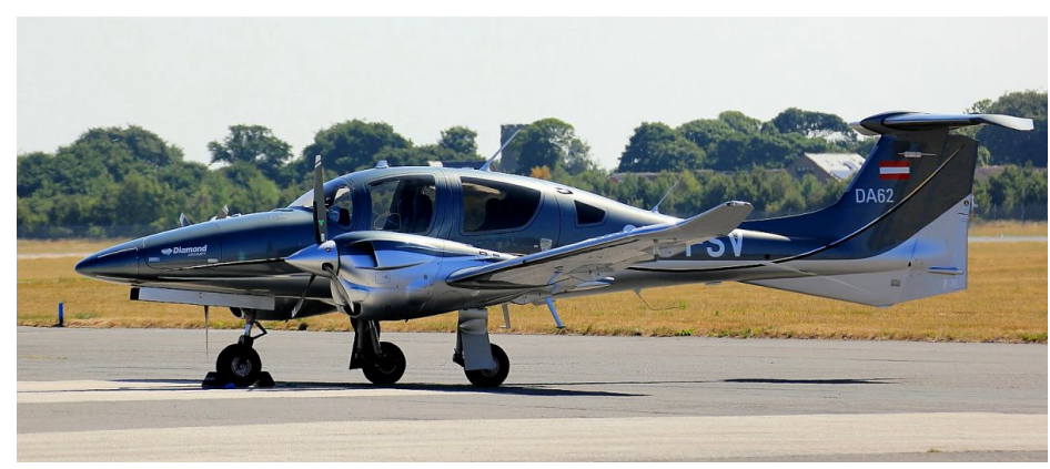
OE-FSV Diamond Aircraft DA-62 28/06