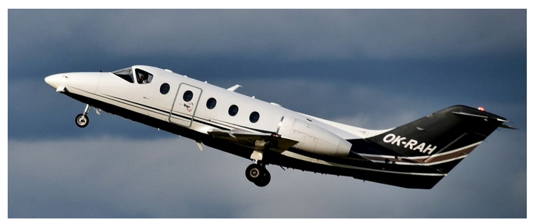
OK-RAH BeechJet Hzwker 400XP 20/06 Rod Hudson