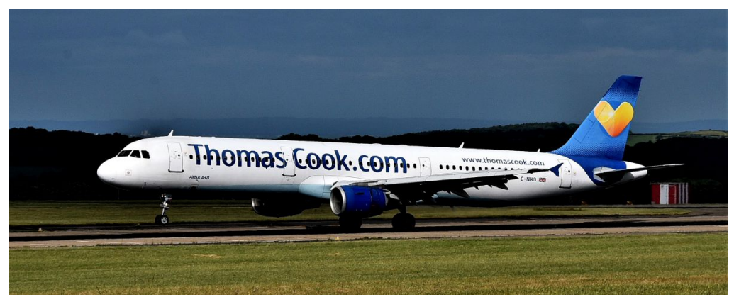
G-NIKO Airbus A321-211 Thomas Cook 20/06 Rod Hudson

Antalya (169/168 -Sun):-3/6 G-TCDL, 10/6 G-TCDD, 17/6 G-TCVD, 24/6 G-TCDB.