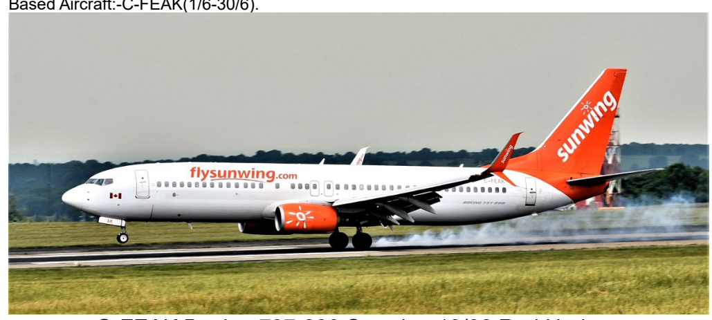
G-FEAK Boeing 737-800 Sunwing 13/06 Rod Hudson