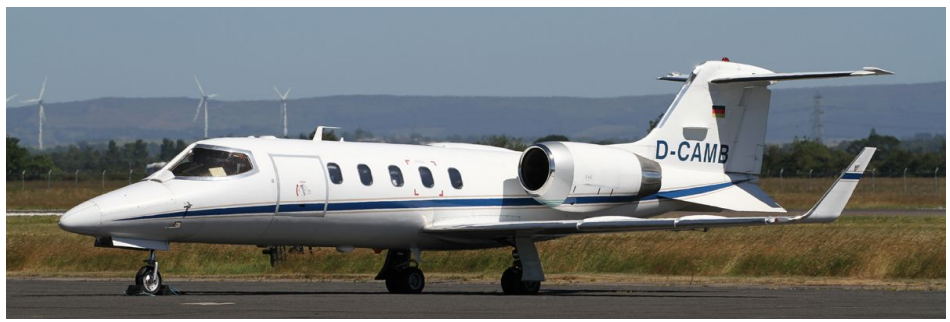
D-CAMB Learjet31 30/06