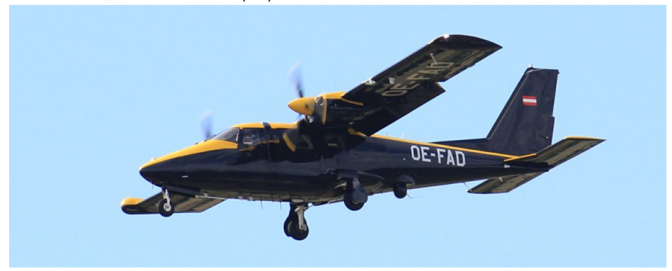
OE-FAD Vulcanair S.P.A. P.68R "Victor" 487/R 20/06

20th OE-FAD Vulcanair S.P.A. P.68R "Victor" 487/R The first NPAS aircraft to arrive at D.S.A. for evaluation, not to be based (FV)