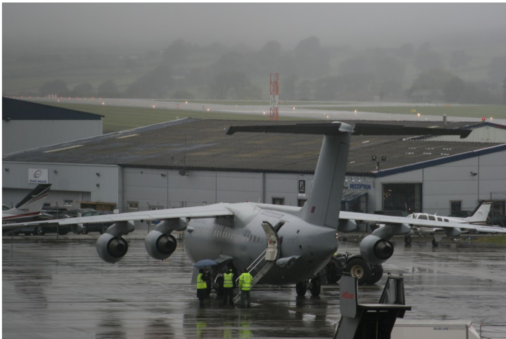
ZE707 BAe 146 RAF 05/10 Ian Gratton

Cessna 560 Excel G-SNJS csn 560-6252 arr 11:48 fr Luton dep 13:33 to Jersey, falcon 2000EX CS-DLE arr 14:14 fr Dalaman as NJE261Y dep 15:24 to Amsterdam, IAI Astra OE-GKW arr 15:09 fr Tenerife dep 18:06 to Innsbruck,