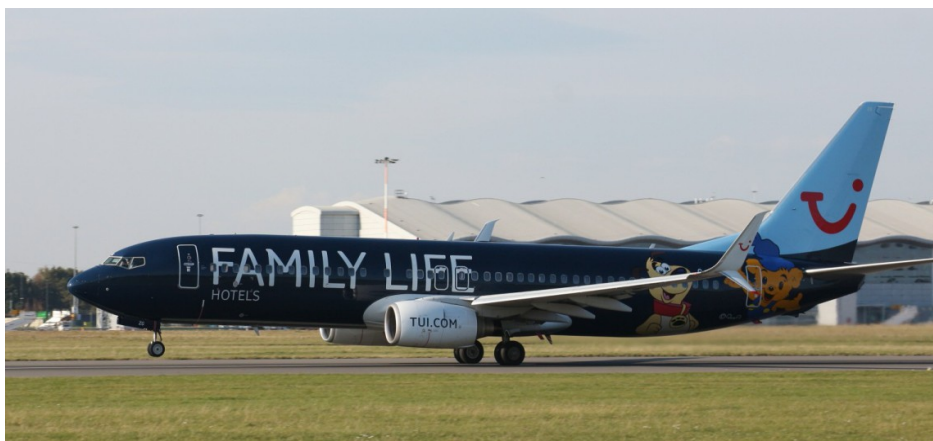
G-FDZG Boeing 737-800 TUI in Family Life Hotels livery 31/10