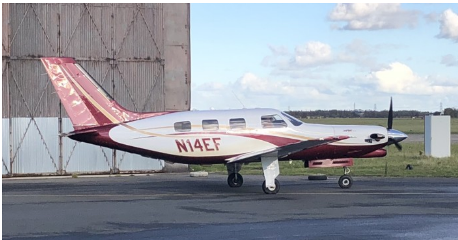
N14EF Piper PA-46-350P Mirage 29/10

29/10 D-IPCH Ce525A CitationJet CJ2 n/s t Hamburg JK Jetcontor AG, N14EF Piper PA-46-350P Mirage f/t Bagby, G-RVLY Cessna F406 Caravan II f Friedrichshafen t East Midlands RVL Aviation, G-GCVV Cirrus SR-22 f East Midlands t Cambridge, D-IDAS