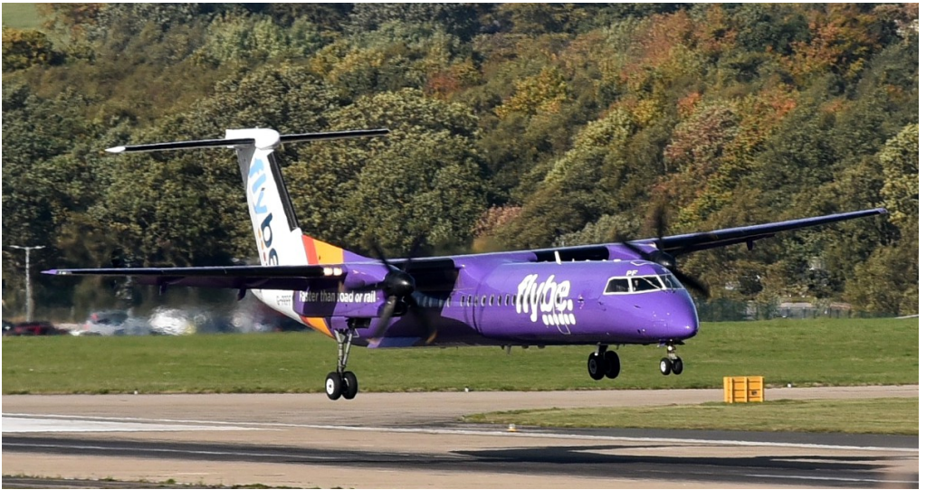
G-PRPF Dash 8-402Q Flybe 09/10 Rod Hudson

Cornwall/St Mawgan(753/754, "5PF/9BX") :-1/10 G-FBJH, 3/10 G-FBJH, 5/10 G-FBJH, 7/10 G-ECOK, 8/10 G-FBJA, 10/10 G-FBJA, 14/10 G-PRPE, 15/10 G-FBJH, 17/10 G-FBJH, 19/10 G-FBJH, 21/10 G-JEDU, 22/10 G-FBJH, 24/10 G-FBJH, 26/10 G-FBJH, 28/10 G-PRPI, 30/10 G-FLBB.