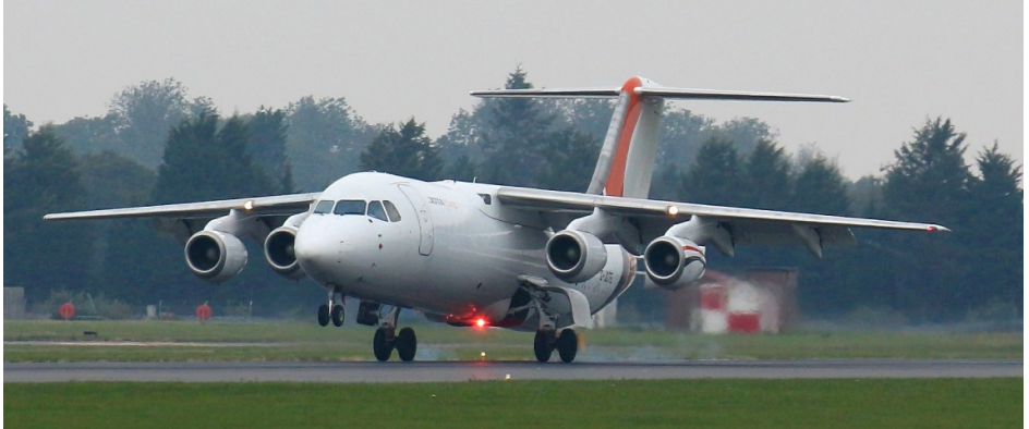
G-JOTE BAe-146-300 Jota Aviation 05/10