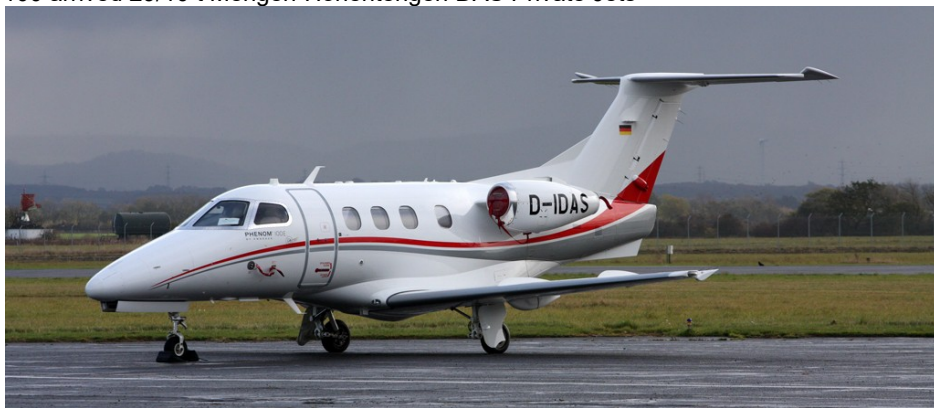
D-IDAS Embraer Phenom 100 31/10

31/10 G-DVIP Agusta A109E f/t Private Site Castle Air Charter, S5-ACJ Embraer ERJ-145 f/t London Gatwick Aero4M, G-BRBA Piper PA-28 Warrior II f/t Full Sutton, G-LCPX Eurocopter EC155 n/s t Private Site Cherterstyle / Starspeed, D-IDAS Embraer Phenom 100 arrived 29/10 t Mengen-Hohentengen DAS Private Jets