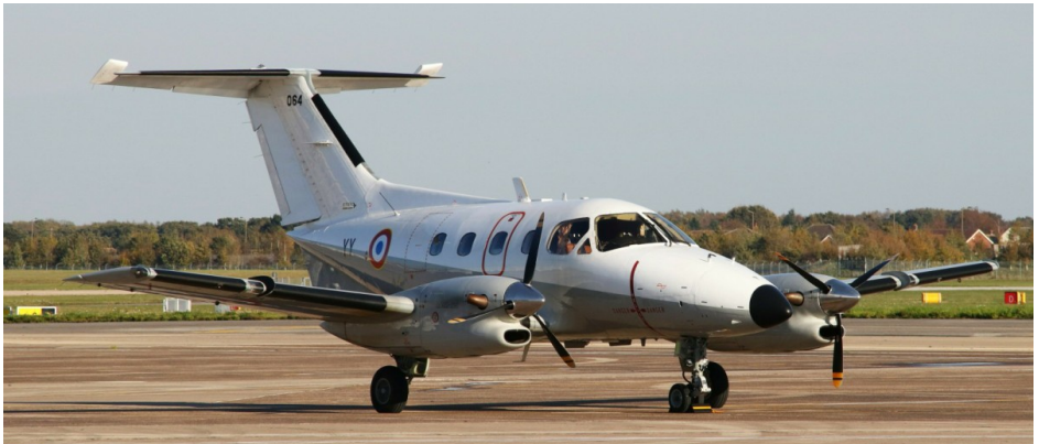
064 Embraer 121 Xingu French Air Force 31/10

(FV) First Visit. (T) Training. (H) Helicopter. (F) Freighter. (M) Maintenance/Textron. (A/D) Arrive-Depart