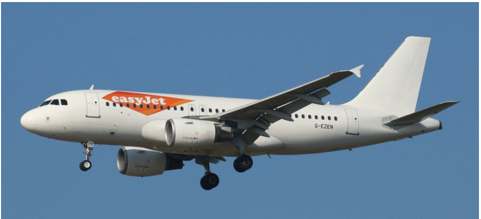
G-EZEN Airbus A-319 EasyJet 10/10