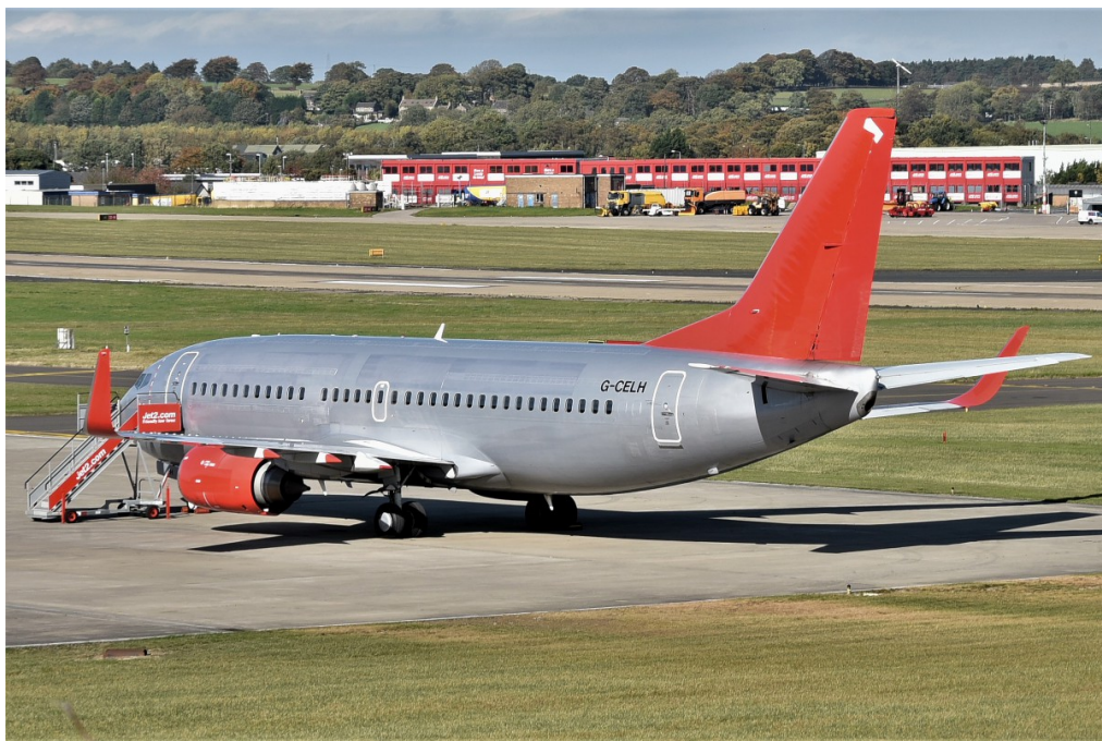
G-CELH Boeing 737-330 Jet2.com (without logos) 09/10

positioned out to Newcastle, G-GDFG(052B) test flight, 16/10 G-GDFO(051B) test flight, G-GDFG(052B) test flight, 18/10 G-GDFG(051B) test flight, 19/10 G-GDFG(052B) test flight, 20/10 G-LSAI(053B) test flight, G-GDFG(051B) test flight, G-JZHB(068J) positioned in from Glasgow, 22/10 G-CELH(051B) positioned out to Lasham, G-LSAA(052B) test flight, 23/10 G-JZHF(031E) positioned in from East Midlands, G-GDFG(031E) test flight, 24/10 G-GDFG(052B) test flight, G-CELY(053B & 054B) test flights, 25/10 G-CELY(011C) positioned out to Glasgow, G-LSAE(069J) positioned in from Manchester, G-GDFM(051B) positioned in from Edinburgh, 26/10 G-CELV(018C) positioned in from Glasgow, G-GDFM(052B) test flight, 27/10 G-GDFN(049A) positioned in from Edinburgh, G-GDFD(043A) positioned in from Manchester, G-GDFM(051B) test flight, G-CELV(048A) positioned out to Edinburgh, 28/10 G-GDFO(046A) positioned out to Malaga, G-GDFC(048A) positioned out to Almeria, G-JZHJ(045A) positioned in from Glasgow, G-LSAN(042A) positioned in from Manchester, G-GDFO(047A) positioned in from Birmingham, 29/10 G-JZHJ(043A) positioned out to Glasgow, G-LSAE(061J) positioned out to Newcastle, G-GDFD(051B) arrived from Alicante, G-GDFM(059B) test flight, G-CELV(041A) positioned in from Edinburgh, G-GDFD(052B) test flight, 30/10 G-CELV(043) positioned out to Edinburgh, 31/10 G-JZBI(041A) position in from Manchester.