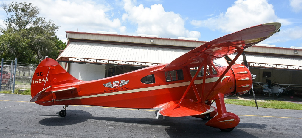
NC15244 Waco Biplane

Whilst in Florida I was fortunate enough to fly in a 1935 Waco Biplane (NC15244). The interesting thing about this aircraft is that not only is it an immaculately restored aircraft, red, shiny and stunning, it was owned by Captain Jeff Skiles, the co-pilot famous for flight 1549 which landed on the Hudson River in 2009.