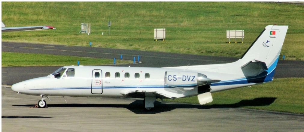
CS-DVZ Cessna 550 Citation II 17/10 Mike Storey

Cessna 525B CJ3 LX-SEB f/t Le Bourget (11:42/12:35), Cessna 550 Citation II CS-DVZ arr 14:58 fr Lydd.