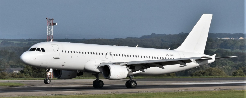
ES-SAQ Airbus A320 Smartlynx operating for Jet2 08/10 Rod Hudson

Charter flights plus positioning flights will be detailed in this section:-1/10 G-JZHW(033E) positioned in from Newcastle, 2/10 G-JZHW(031E) positioned out to Newcastle, G-DRTH(034E) positioned in from Manchester, 3/10 G-GDFE(043A/044A) positioned out to/in from Belfast, G-GDFW(039E) positioned in from Birmingham, 4/10 G-DRTO(030E) positioned out to Manchester, G-DRTA(041A) positioned out to Stansted, G-JZBM(042A) positioned out to Birmingham, G-GDFT(043A) positioned out to Manchester, G-DRTF(044A) positioned in from Manchester, G-GDFT(045A) positioned in from Manchester, 6/10 G-GDFO(049A) positioned out to Manchester, G-DRTB(055B) positioned in from East Midlands, G-GDFO(048A) positioned into Manchester, 7/10 G-JZBO(041A) positioned out to Manchester, G-GDFW(030E) positioned out to Manchester, G-GDFT(042A/043A) positioned out to Ibiza/in from Manchester, G-GDFW(032E) positioned in from Manchester, G-DRTO(044A) positioned in from Birmingham, 8/10 G-CELY(031E) positioned in from East Midlands, 9/10 G-DRTT(032E) positioned in from Manchester, G-GDFE(030E) positioned out to East Midlands, 10/10 G-DRTD(060J) positioned out to Manchester, G-DRTB(051B) positioned out to Manchester, 11/10