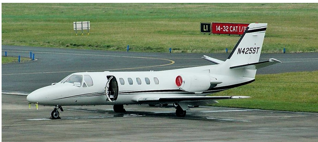
N425ST Citation 24/10 Mike Storey

Legacy 650 G-WIRG dep 00:08 to Dublin, Beech 200 S.Kingair G-WNCH f/t Fair Oaks (09:24/15:52).