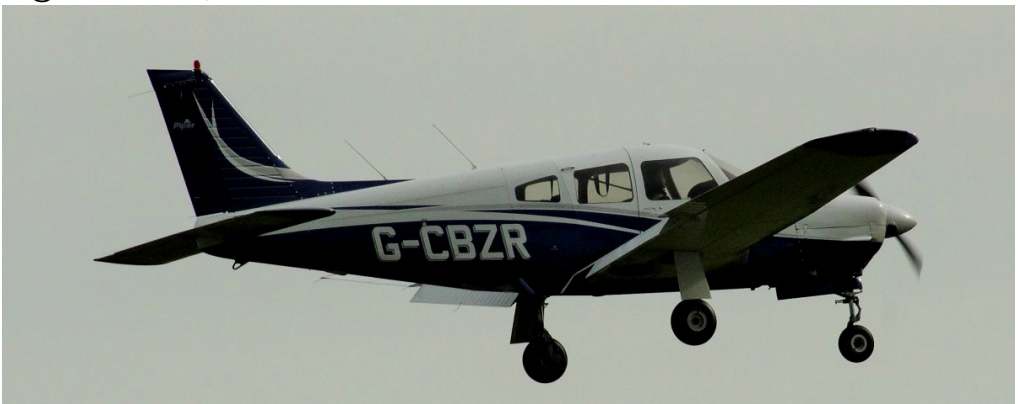
G-CBZR Piper PA-28R Cherokee Arrow 03/10 Mike Storey

Cessna 525A CJ2 D-INOB arr 09:04 fr Venice dep 10:11 to Barcelona, Piper PA-28R Cherokee Arrow G-CBZR f/t Blackbushe (10:43/12:00), Falcon 2000EX CS-DLL arr 14:29 fr EMA dep 16@08 to Gibraltar,