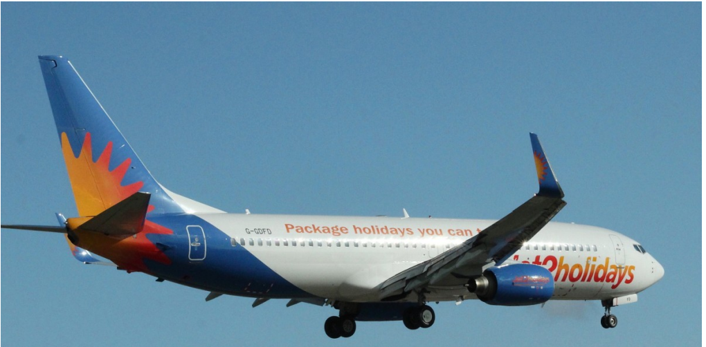
G-GDFD Boeing 737-800 Jet2.com 17/10 Mike Storey

Charter flights plus positioning flights will be detailed in this section:-1/10 G-JZHW(033E) positioned in from Newcastle, 2/10 G-JZHW(031E) positioned out to Newcastle, G-DRTH(034E) positioned in from Manchester, 3/10 G-GDFE(043A/044A) positioned out to/in from Belfast, G-GDFW(039E) positioned in from Birmingham, 4/10 G-DRTO(030E) positioned out to Manchester, G-DRTA(041A) positioned out to Stansted, G-JZBM(042A) positioned out to Birmingham, G-GDFT(043A) positioned out to Manchester, G-DRTF(044A) positioned in from Manchester, G-GDFT(045A) positioned in from Manchester, 6/10 G-GDFO(049A) positioned out to Manchester, G-DRTB(055B) positioned in from East Midlands, G-GDFO(048A) positioned into Manchester, 7/10 G-JZBO(041A) positioned out to Manchester, G-GDFW(030E) positioned out to Manchester, G-GDFT(042A/043A) positioned out to Ibiza/in from Manchester, G-GDFW(032E) positioned in from Manchester, G-DRTO(044A) positioned in from Birmingham, 8/10 G-CELY(031E) positioned in from East Midlands, 9/10 G-DRTT(032E) positioned in from Manchester, G-GDFE(030E) positioned out to East Midlands, 10/10 G-DRTD(060J) positioned out to Manchester, G-DRTB(051B) positioned out to Manchester, 11/10