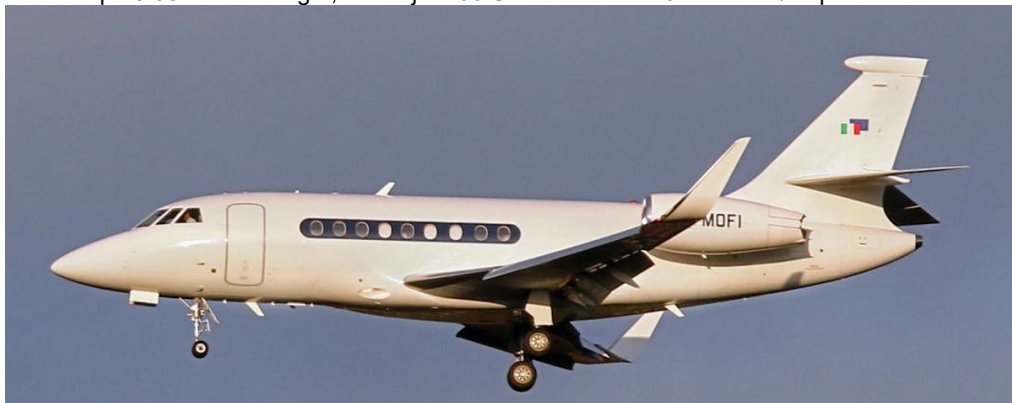
I-MOFI Falcon 2000LX 26/10 Paul Whincup

Agusta A109S Power G-DAYD dep 13:14 to Carlisle, Cessna 510 Mustang F-HAHA arr 19:43 fr EDI dep 20:38 to Le Bourget, Beechjet 400 SP-TAT arr 21:26 fr Reus n/stop.