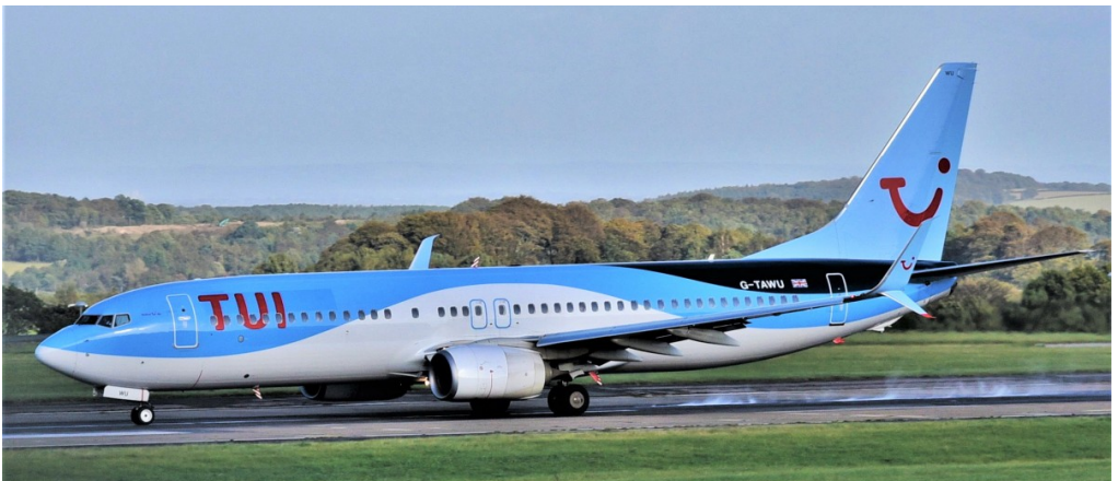
G-TAWU Boeing 737-8K5 TUI 08/10 Rod Hudson

Palma (3619 "4AT"/3618 "7DC" -Sat):-5/10 G-FDZE, 12/10 G-FDZX, 19/10 G-FDZE, 26/10 G-TZWK.