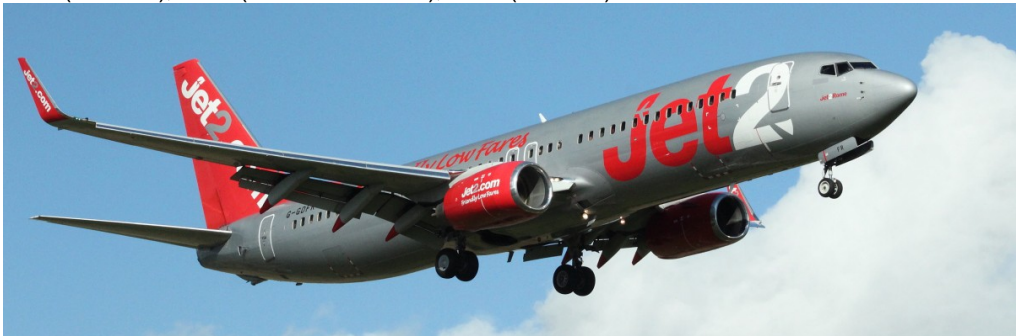
G-GDFR Boeing 737-800 Jet2holidays 17/10 Mike Storey

Jet2 are to lease a based SmartLynx A320 for the Summer, although will change regularly:- ES-SAP 2/10(223/224), 5/10 (MYX9776) positioned out to Brussels, ES-SAQ 4/10 (MYX9251) positioned in from Tallinn, 5/10(251/252), 6/10(439/440), 7/10(185/186), 8/10(271/272), 11/10(231/232/431/432), 12/10(197/198) then positioned out to Manchester(MYX9771), 13/10(MYX9772) positioned in from Manchester, 14/10(185/186), 15/10(271/272), 18/10(231/232/431/432), 20/10(331/332), 21/10(185/186), 22/10(271/272), 23/10(271/272), 25/10(231/232/431/432), 31/10(251/252).