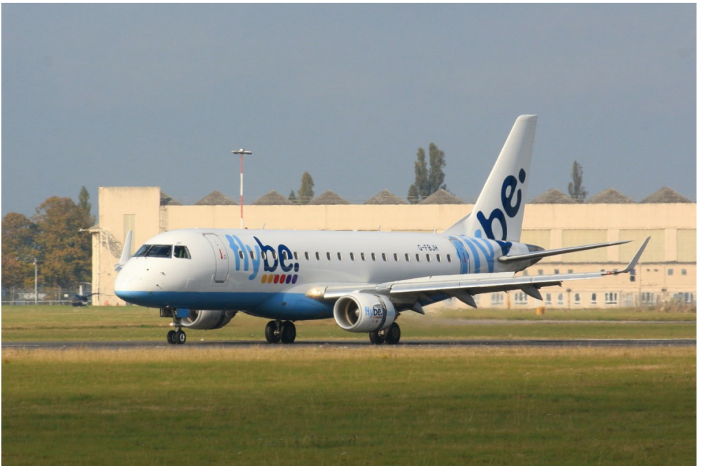
Flybe Embraer-175 G-FBJH 23/10 The last few days of operation