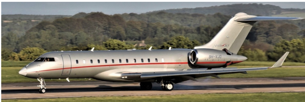
9H-VJO Global 6000 08/10 Rod Hudson