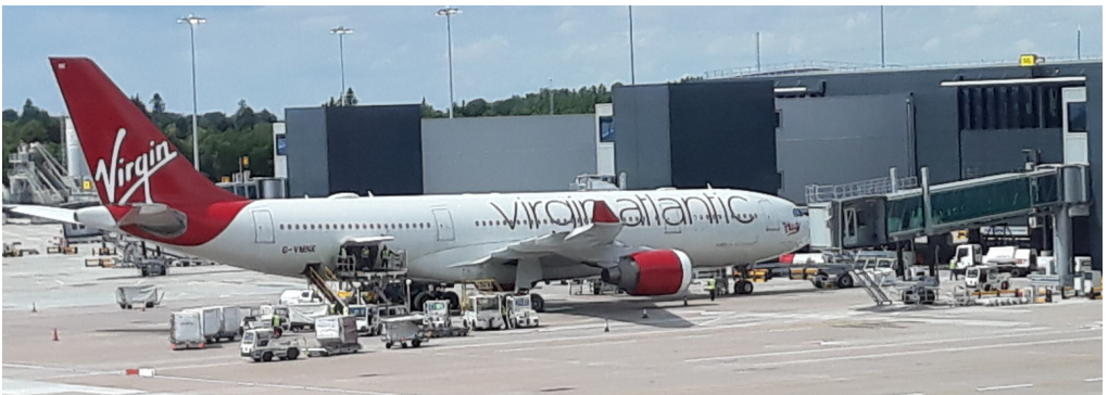
Our aircraft G-VMNK at the new pier

We went over to stay in the Premier inn the night before. Much more expensive than normal due to various concerts being held in Manchester with most hotels being booked up on the day. On this occasion, I kept holding off for a lower price and it never came, so we ended paying much more than normal. We went down for a drink in the evening and it reminded me of a Friday morning in that children were running around the place and making a loud noise. Keep your children under control please!!