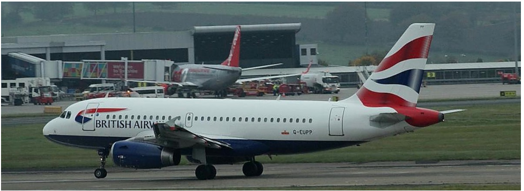
G-EUPP Airbus A319 BA 24/10 Mike Storey

Heathrow (1346/1347, "20D/21V"):-27/10 G-EUOC, 28/10 G-EUPU, 29/10 G-EUPC, 30/10 G-EUOF, 31/10 G-EUPA.