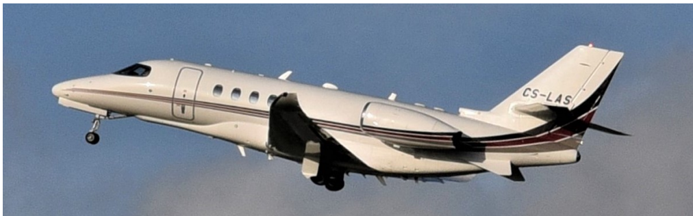
CS-LAS Cessna 680 Latitude 08/10 Rod Hudson

Piper PA-31 Navajo N642P f/t Newtownards (11:46/16:06), Beech S.Kingair 200 G-NIAB f/t Belfast (12:03/13:35), Cirrus Sr22 G-KOCO f/t Booker (14:01/14:40), Challenger CL605 9H-VFF arr 16:14 fr Farnborough dep 17:59 to Zurich, Cessna 680 Latitude CS-LAS dep 16:45 to Le Bourget, Global 6000 9H-VJO arr 16:49 fr Luton n/stop, Cessna 550 Citation II CS-DVZ arr 20:38 fr Madrid n/stop.