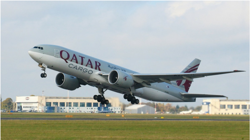
A7-BFH Qatar Airways Cargo Boeing 777 23/10