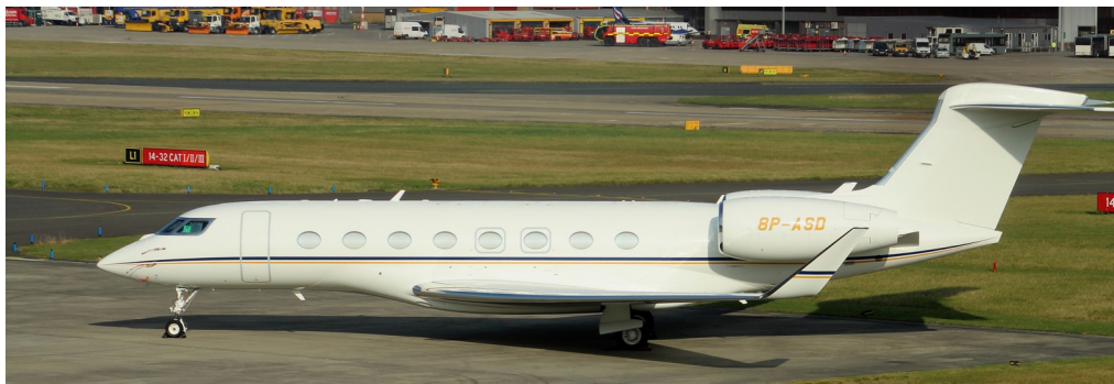
8P-ASD Gulfstream 650 31/10 Ian Gratton

Challenger 350 9H-VCO dep 09:17 to Farnborough, Cessna 680 Latitude CS-LTH dep 09:20 to Copenhagen ret at 18:12 n/stop, IAI Astra OE-GKW dep 12:20 to Innsbruk, Beechjet 400 SP-TAT dep 18:25 to Manchester.