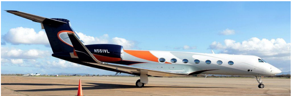
N551VL Gulfstream G550 02/11