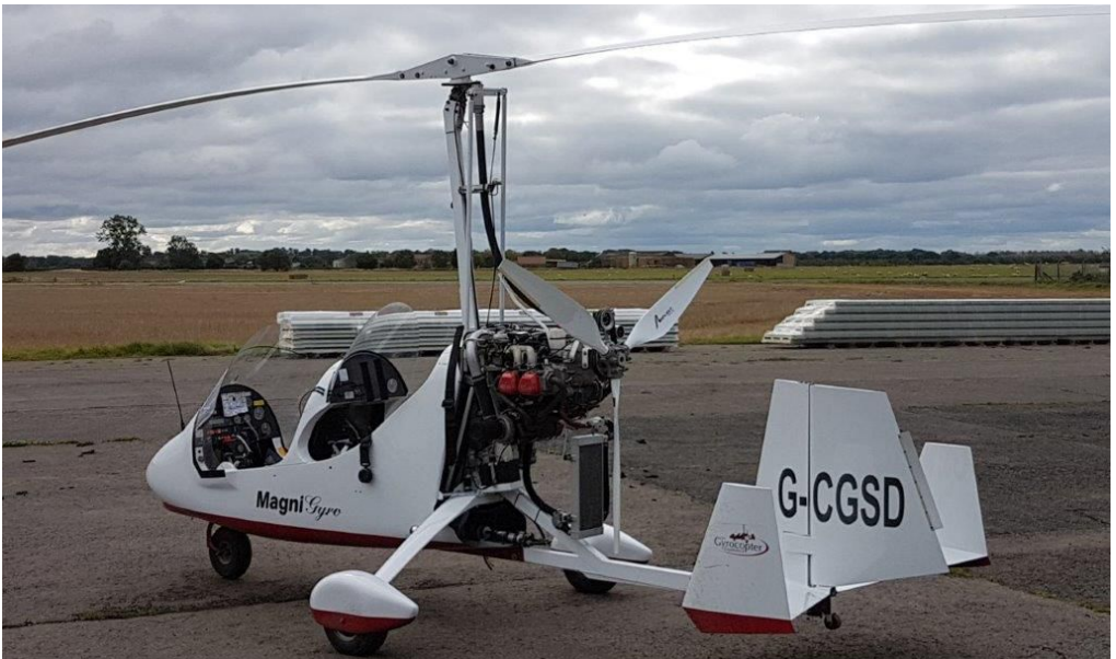
G-CGSD Magni M16C

former two seat sim - rejected production pod