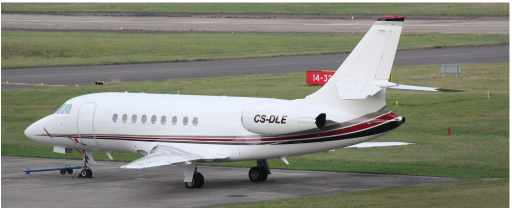
CS-DLE Falcon 2000EX 01/11 Mike Storey

Gulfstream 650 G-REFO 08:30 from Luton dep 10:02 to San Diego, Mooney M20P F-HISS dep 09:07 to Odense, Beech 200 Kingair ZK455 overshoot at 11:37 c/s CWL68, Beech E90 Kingair