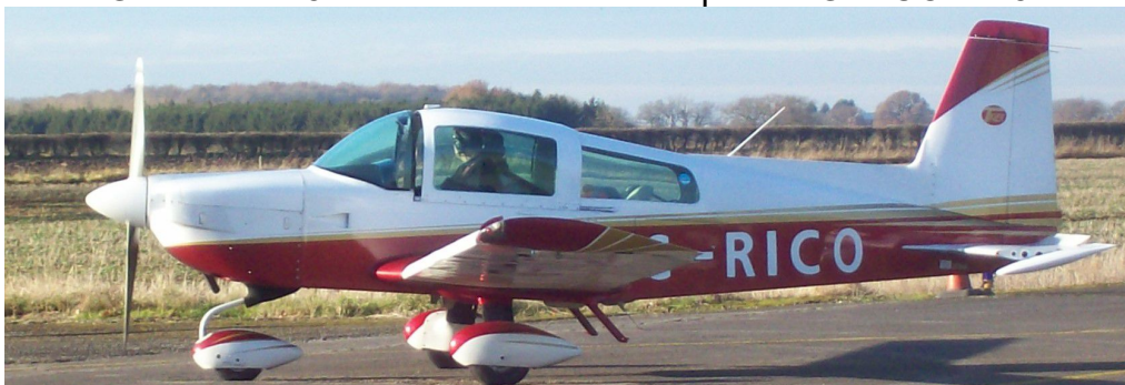
G-RICO AA-5 for maintenance with EAE