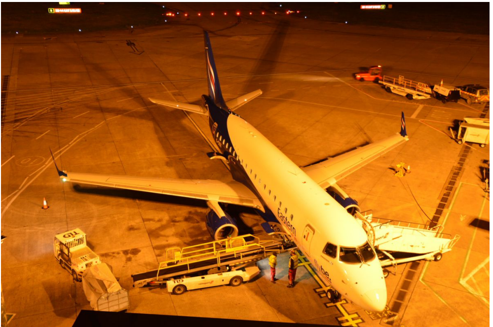
G-CIXV Embraer 170 Eastern Airways 19/11