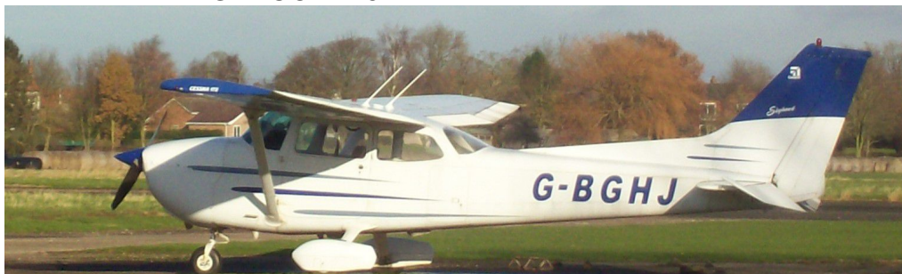
G-BGHJ F.172N f Sandtoft t Humberside