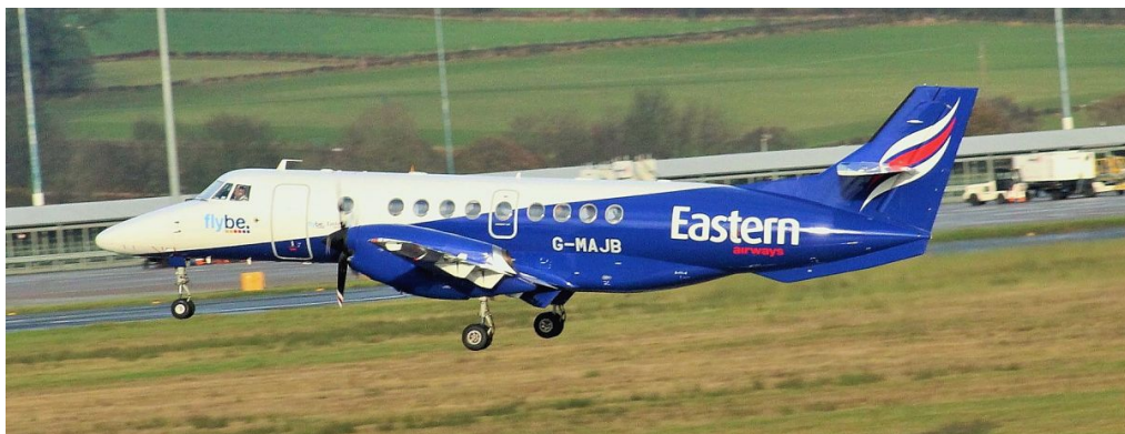
G-MAJB Jetstream 41 Eastern Airways 01/11 Mike Storey

1/11 G-MAJW(70Y/71G/7606/66Y) G-MAJK(77G) G-MAJY(7609/72Y/7604/65Y/7605/7608), 2/11 G-MAJK(7609) G-MAJZ(72Y/7604/65Y/7605/7608) G-MAJB(70Y/761D/7601) G-MAJC(7606/66Y/77G), 3/11 G-MAJC(7604/65Y/7605/7608) G-MAJZ(70Y/63Y/7603/7606/66Y/77G), 6/11 G-MAJC(70Y/71G/7601) G-MAJW(7606/66Y/77G) G-MAJZ(7609/72Y/602/63Y/7604/65Y/7605/7608), 7/11 G-MAJZ(70Y/71G/7601/7606/66Y/77G) G-MAJW(7609/72Y/602/63Y/7604) G-CDEA(7605), 8/11 G-MAJZ(7609/72Y/602/65Y/7605/7608) G-MAJW(71G/7601/7606/66Y/77G), 9/11 G-MAJW(70Y/71G/7601/7606/66Y/77G) G-MAJC(7608) G-MAJZ(7609/72Y/602/63Y/7604/65Y/7605), 10/11 G-MAJC(70Y/63Y/7603) G-MAJW(7604/65Y/7605) G-MAJB(7608) G-MAJZ(7606/66Y/77G), 13/11 G-MAJZ(7609/72Y/602/63Y/7604/65Y/7605/7608) G-MAJB(70Y/71G/7601/7606/66Y/77G), 14/11 G-MAJZ(7609) G-MAJL(72Y/602/63Y/7604/65Y/7605/7608) G-MAJB(70Y/71G/7601) G-MAJW(7606/66Y) G-MAJD(77G/7609), 15/11 G-MAJL(70Y/71G/7601/7606/66Y/77G) G-MAJD(72Y/602/65Y/7605/7608), 16/11 G-MAJD(70Y/71G/7601/7606/66Y/77G) G-MAJC(7609/72Y/602/63Y/7604/65Y/7605/7608), 17/11 G-CERY(7606/7605) G-MAJA(7600/63Y/7604/65Y/66Y/77G) G-MAJC(7603), 20/11 G-MAJA(70Y/71G/602/63Y/7604/65Y/7605/7608) G-CFLU(72Y/7601), 21/11 G-MAJA(70Y/71G/7601/7606/66Y/77G) G-MAJB(72Y/602/63Y/7604/65Y/7605/7608), 22/11 G-MAJA(7609/72Y/602/65Y/7605/7608), G-MAJB(70Y/71G/7601) G-MAJW(7606/66Y/77G),