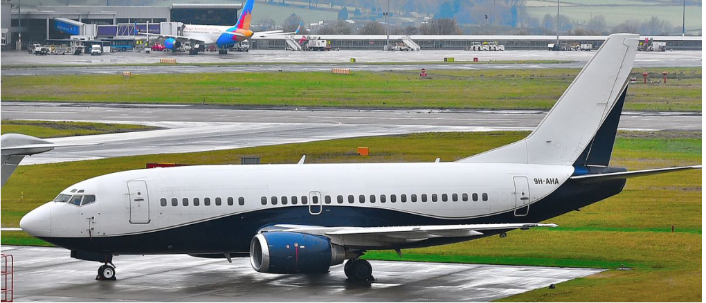
9H-AHA Boeing 737-505 Air X Charter 21/11

Cessna 560 Excel CS-DXF arr 11:13 fr Doncaster as NJE867F n/s, Boeing CH47 Chinook ZH 900 overshoot at 13:53 and ret Odiham c/s SHF430, Cessna 525B CJ3 M-MSVI arr 17:23 fr Cardiff dep 17:43 to Dundee, Learjet 35A D-CTRI arr 17:55 fr Faro dep 20:23 to Birmingham.