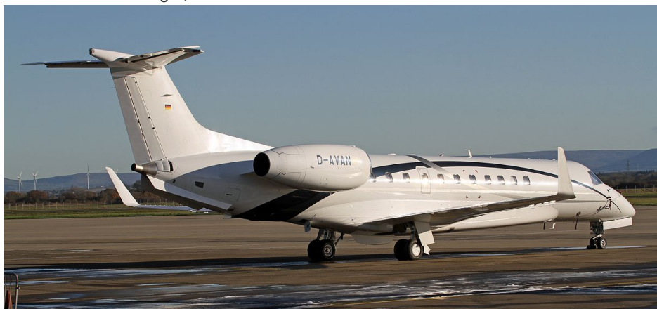
D-AVAN Embraer 135BJ Legacy 600 26/11