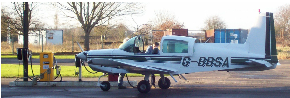
G-BBSA AA-5 from Durham to collect pilot of G-RICO AA-5