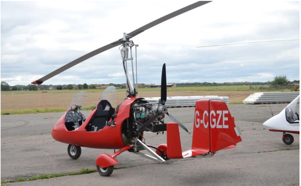
Illustration 1: G-CGZE Rotorsport UK MTOSport