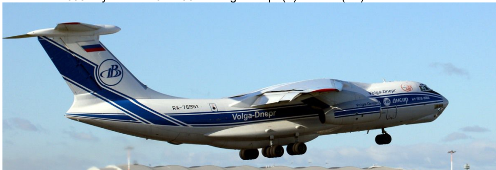
RA-76951 Ilyushin IL76-TD90VD Volga Dnepr 12/11