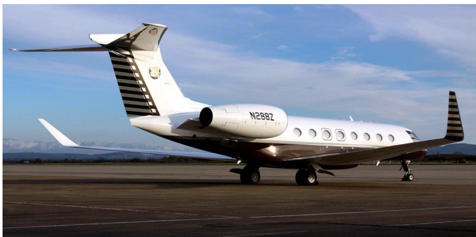
N288Z Gulfstream G650 26/11