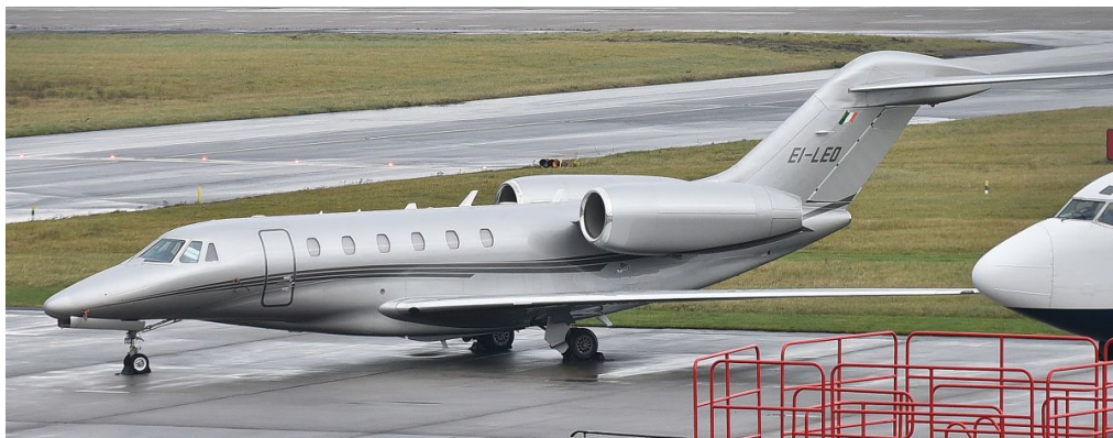
EI-LEO Cessna 750 Citation X 21/11 Rod Hudson

Piper PA46-500TP N363JR dep 08:24 to Ostend, Piper PA-28 Cherokee G-AVRK arr 10:56 fr Teeside, Cessna 210 Centurion N210AD dep 12:03 to Guernsey, Cessna 525 CJ1 G-CJDB arr 14:34 fr Bristol dep 15:02 to Biggin Hill, Robinson R44 G-ROYM arr 15:03, Beechjet 400 G-SKBD arr 19:03 fr Cardiff.