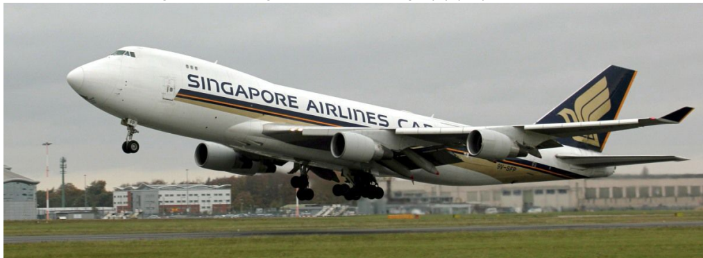
9V-SFP Boeing 747-400 Singapore Airlines Cargo 07/11