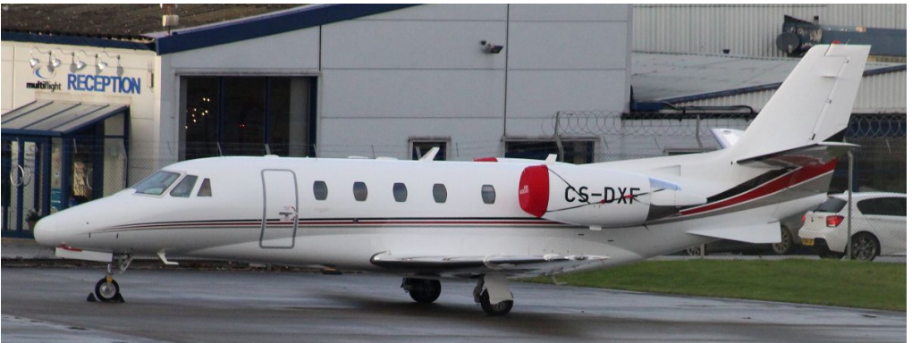
CS-DXF Citation 560XL 21/11 Mike Storey