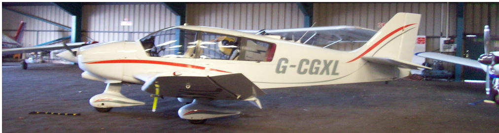
G-CGXL DR400 new resident