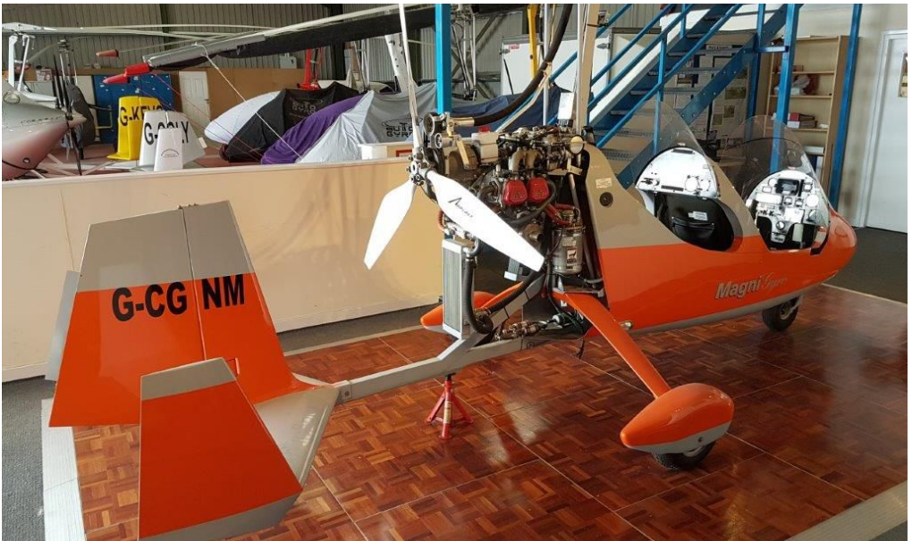
G-CGNM Magni M16C