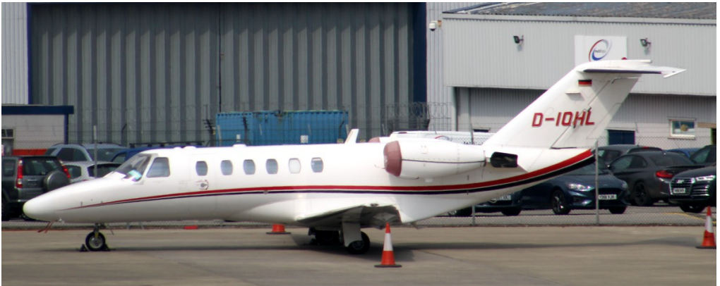
D-IOHL Cessna 525A CJ2 24/04 Ian Gratton