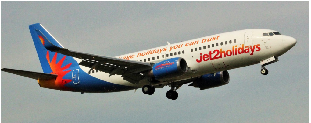
G-GDFM Boeing 737-800 Jet2holidays 18/04