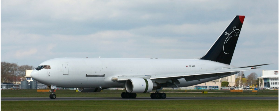
SP-MRF Boeing 767-200 Air Taxi

1st SP-MRF Boeing 767-200 Air Taxi (F) D-A + 4th D-A. 5th D-A-D. 8th A. 9th D-A. 10th D-A 11th D-A. 13th D-/----- End of contract