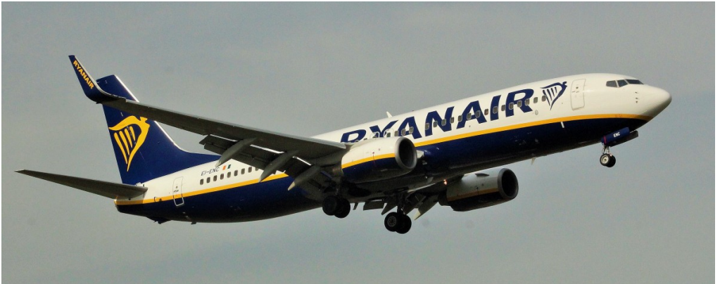
EI-ENC Boeing 737-800 Ryanair 18/04