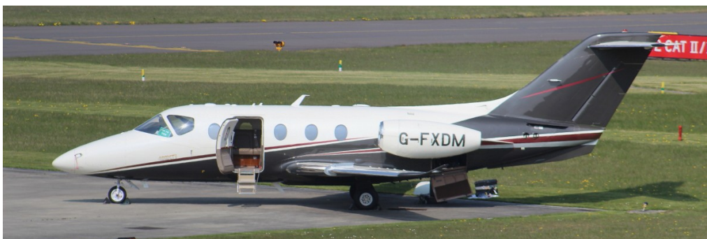
G-FXDM Beechjet 400 17/04 Ian Gratton

Eurocopter EC155 EI-XHI dep 10:54 arr back 11:59 dep Blackpool at 13:17 ret at 14:17 dep 16:35, Bellanca 17 N28141 arr 12:09 fr Cranfield ret at 1400, Diamond DA42 G-FFMV arr 14:37 fr RAF Leuchars c/s nighthawk until ?, Learjet 40 I-GURU f/t Linate (17:30/18:20).