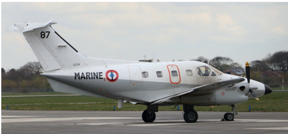
87 Embraer 121 Xingu French Air Force 04/04

4th 87 Embraer 121 Xingu French Air Force