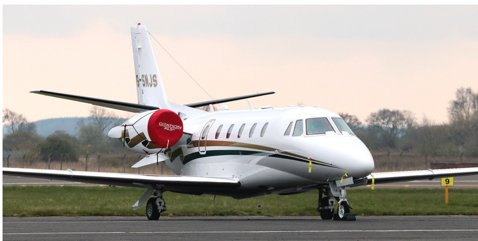
G-SNJS Ce560XL Citation XLS+ 09/04