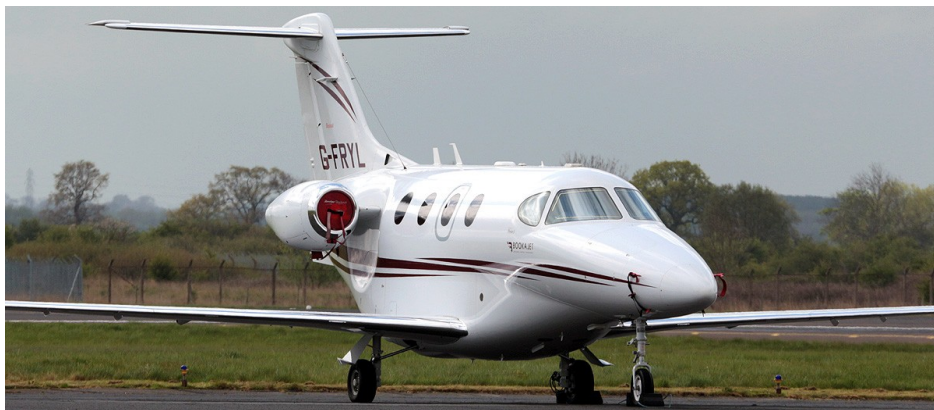
G-FRYL Raytheon Premier 1 28/04