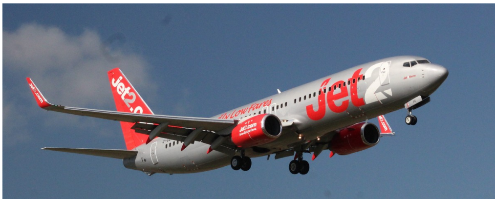
G-GDFR 737-800 Jet2.com 11/04 Mike Storey

Other flights:-18/4 G-ECOF(041P/7979) positioned in from Manchester/departed to Belfast, 19/4 G-JEDT9041P) positioned out to Southampton.