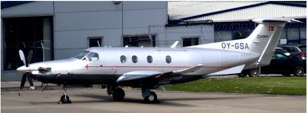
OY-GSA Pilatus PC-XII 24/04 Ian Gratton