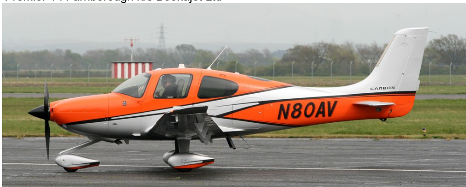
N80AV Cirrus SR-22T 26/04