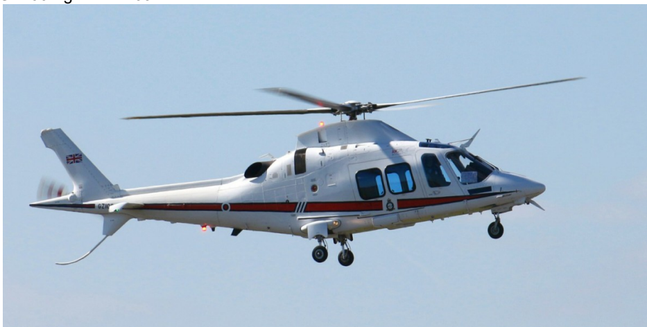
GZ100 Agusta A-109 R.A.F 10/04