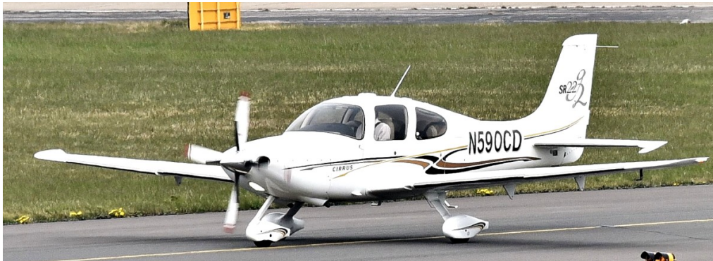
N590CD Cirrus SR22 16/04 Rod Hudson

Socata TB-20 Trinidad G-SCIP arr 08:56 fr Haverfordwest ret at 13:58, Phenom 100 ZM337 ILS approach at 10:17 c/s CWL42, Eurocopter EC155 EI-XHI ( csn 6643) dep 10:35 ret at 11:14 dep 16:08 to Teesside c/s MFT01T ret at 16:58 n/s. Diamond DA40 N264DS dep 13:36 to Blackpool.