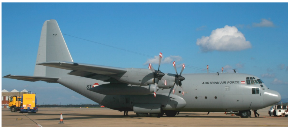
8T-CC C-130K Hercules 05/04