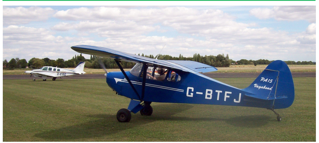
G-BTFJ PA-15 for fish and chips at the Heapham chippy