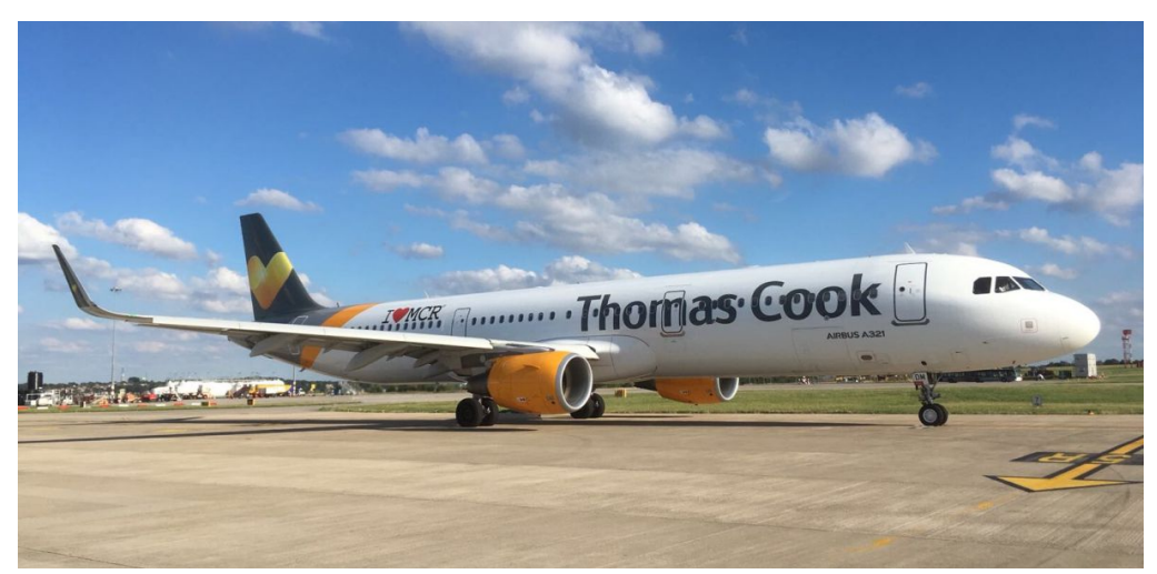
G-TCDM Airbus A320 Thomas Cook 02/08

Additional flights:-10/8 G-FDZG(9016/91H) positioned in from Manchester