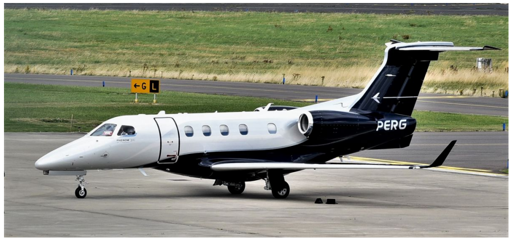
G-PERG EMB-505 Phenom 300 16/08 Rod Hudson

Diamond DA-42 Twin Star G-FFMV arr 12:31 fr Coningsby until 31<sup>st</sup>, Phenom 300 G-PERG arr 12:59 fr Stockholm-Bromma dep 13:41 to Stanted, Socata TBM850 N850LH arr 20:16 fr Reykjavik n/s.