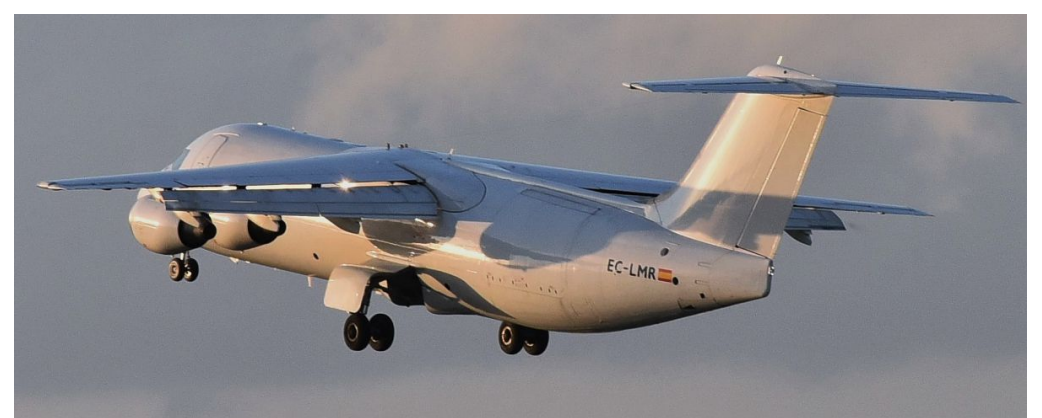
EC-LMR BAe 146-300QT 23/08 Rod Hudson