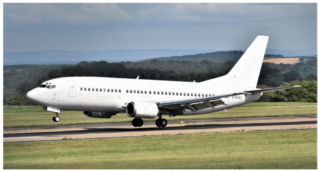
G-POWC Boeing 737-33A Titan 29/08 Rod Hudson