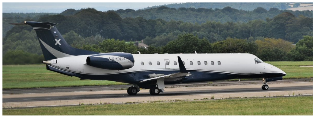
LX-OLA ERJ-135 BJ Legacy 600 21/08 Rod Hudson

Cirrus SR22 N220AD arr 12:43 fr Loudon (Fr) until ?, Challenger 850 9H-ILA arr 14:04 fr Jersey as Vistajet 600 until 22^{nd} , Falcon 2000EX CS-DLF arr 15:39 fr Ibiza as NJE823K n/s , Vickers VS50-9 Spitfire IX G-CCCA arr 16:11 fr Duxford (initially for fuel but weather prevented departure so n/s), Legacy 600 LX-OLA arr 17:14 fr Norwich n/s.