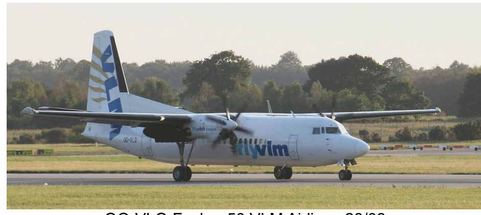
OO-VLQ Focker 50 VLM Airlines 28/08

23rd N546JN McDonnell Douglas MD11 Western Global Airlines (F) (FV)