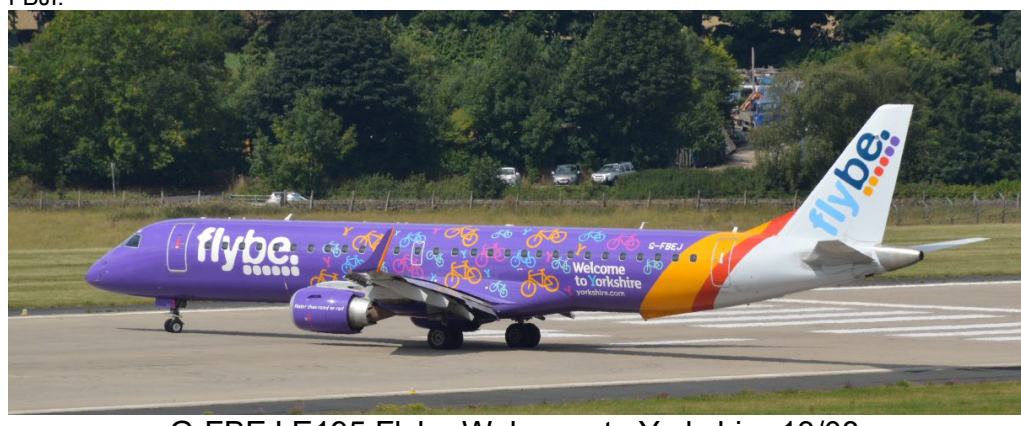
G-FBEJ E195 Flybe Welcome to Yorkshire 13/08

Innsbruck(9226/9225, "59BM/3VU", Sat):-4/8 G-FBJK, 11/8 G-FBJB, 18/8 G-FBJI, 25/8 G-FBJI.