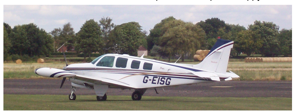
G-EISG Be36 visitor from/to Sherburn