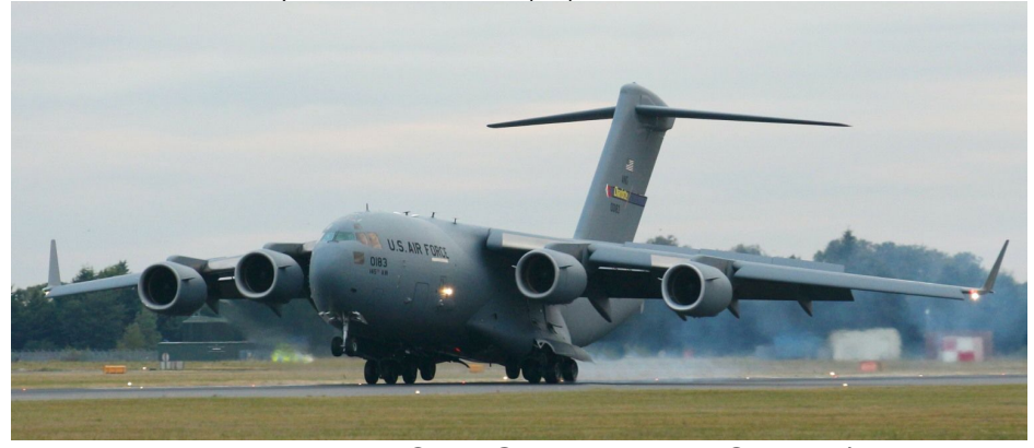
00-0183 Boeing C-17 Globemaster USAF 14/08

14th 00-0183 Boeing C-17 Globemaster U.S.A.F. Brought 6 Vehicles & a few troops from McChord AFB it then departed to Mildenhall. (FV)