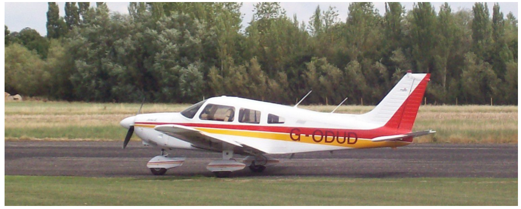
G-ODUD PA-28 from/to Gamston