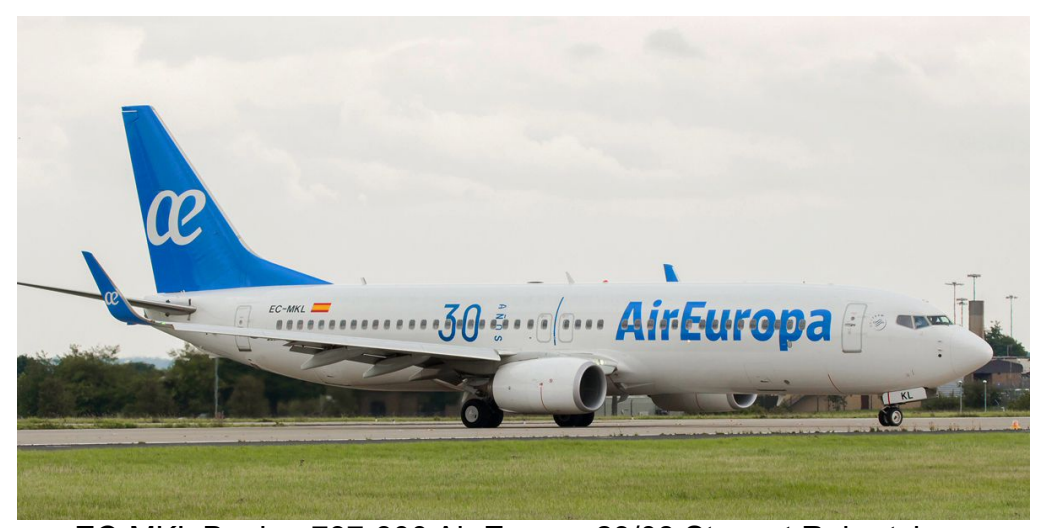
EC-MKL Beoing 737-800 Air Europa 23/08 Stewart Robertshaw

The company operates a weekly charter flight from/to Palma using B737 aircraft. Palma (217/218, "217/218", Mon):-6/8 EC-LYR, 13/8 EC-LXV, 20/8 EC-MKL, 27/8 EC-LQX.