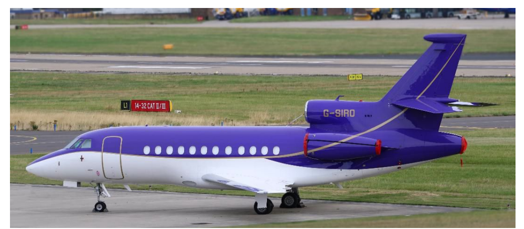
G-SIRO Falcon 07/08 Paul Whincup