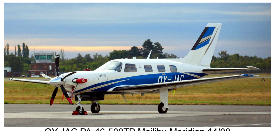
OY-JAC PA-46-500TP Mailibu Meridian 14/08