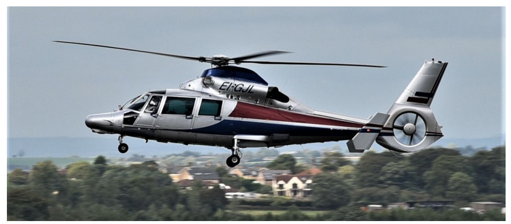
G-SCPJ Hawker 900 XP 23/08 Rod Hudson